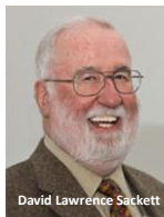
David Lawrence Sackett

Sackett et al. BMJ 1996. January 13;312:71-2.